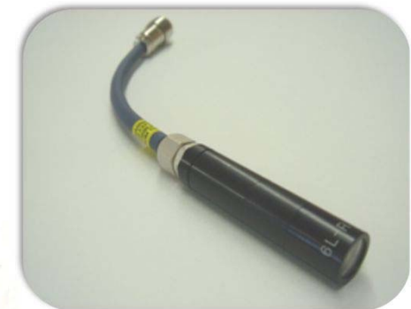
LED head (With cable, 1500mm) 1 ~ 4 lines