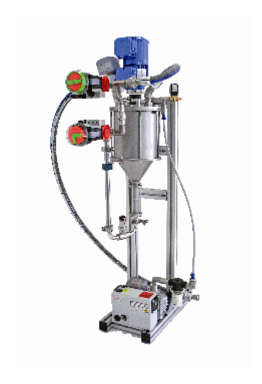
ViscoTreat-Inline for degassing