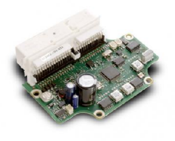
Example: PCB-Board (source TRW)

Example: ESP-control-system (source: BOSCH)