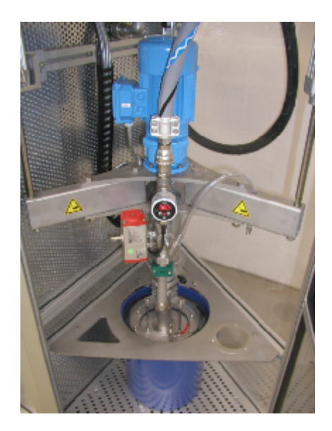
fig. 1: principle of the system